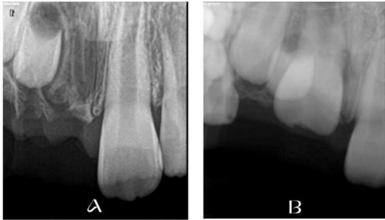
Figure 2. A. Radiograph showing the extraction of the 1.1. instead of the supernumerary bud. B. Radiograph after the re-implantation.

The same doctor checked the girl in the period following the extraction to evaluate the post-extraction phase. The dentist maintained that the accidentally extracted incisor suffered no trauma and reported that tooth 1.1's emergence was slow but gradual, asserting that the tooth would have resumed its natural course. However, a CBCT was required by the child parents, assessing the presence of the ST (Figure 3).