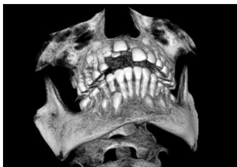
Figure 3. Volume rendering of the CBCT.

The same doctor checked the girl in the period following the extraction to evaluate the post-extraction phase. The dentist maintained that the accidentally extracted incisor suffered no trauma and reported that tooth 1.1's emergence was slow but gradual, asserting that the tooth would have resumed its natural course. However, a CBCT was required by the child parents, assessing the presence of the ST (Figure 3).