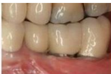
Figure 9. Intraoral view after prosthetic rehabilitation