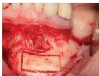
Figure 2. The autograft from the chin areas