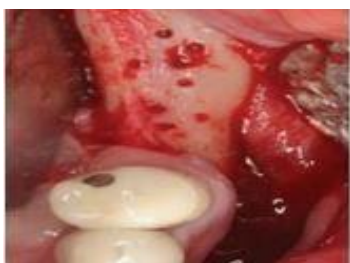
Figure 3. Recipient area before autograft surgery with round bar