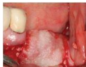
Figure 5. Intraoral clinical view, the empty space in the donor area was filled with bone material Bio Oss and then closed with resorbable membrane