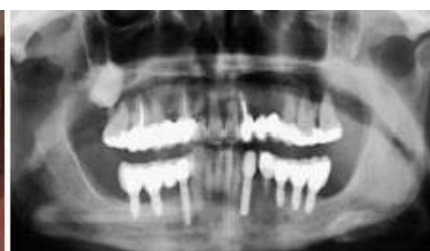
Figure 10. CT scan after prosthetic rehabilitation