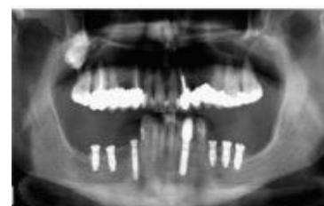
Figure 7. CT scan after implants insertion