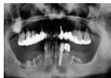
Figure 6. CT scan after autograft surgery, the autograft was adapted and fixed in the donor area with titanium screws