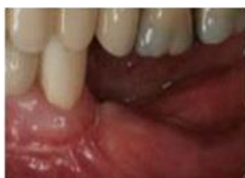
Figure 8. Intraoral clinical view before implant screws removed