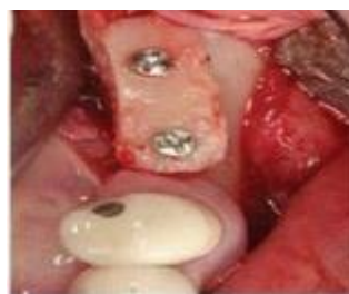
Figure 4. The autograft was adapted and fixed in the donor area with titanium screws